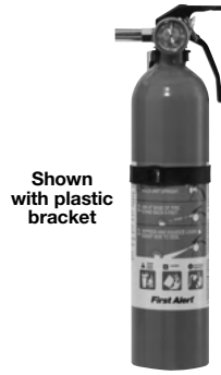
Shown with plastic bracket