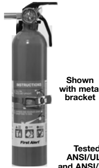
Shown with metal bracket

Tested to ANSI/UL 711 and ANSI/UL 299 Models FE5GR, FE10GR, FE1A10GR